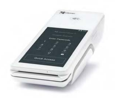
Clover Flex Robust functionality. Ultimate flexibility. Total simplicity.

The flexible solution designed to meet your full range of payment and point-of-sale needs.